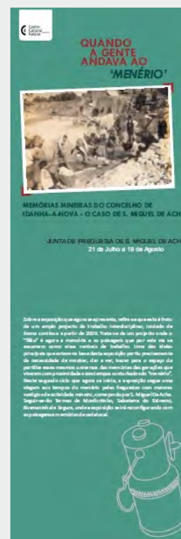
- Flyer "When we went for Ore" – the S. Miguel D'Acha case - Idanha-a-Nova Municipality