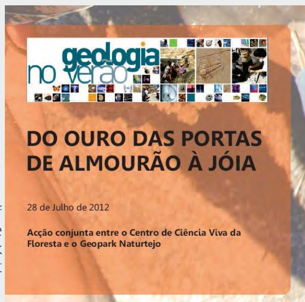
- Flyer «From the gold of Portas de Almourão to the jewel» Naturtejo Geopark and Living Science Forest Centre